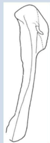
→ distal portion of aedeagus